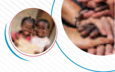
Figure 5: Engaging the Public through radio and Fact Sheets for MSM, sex workers and Health workers