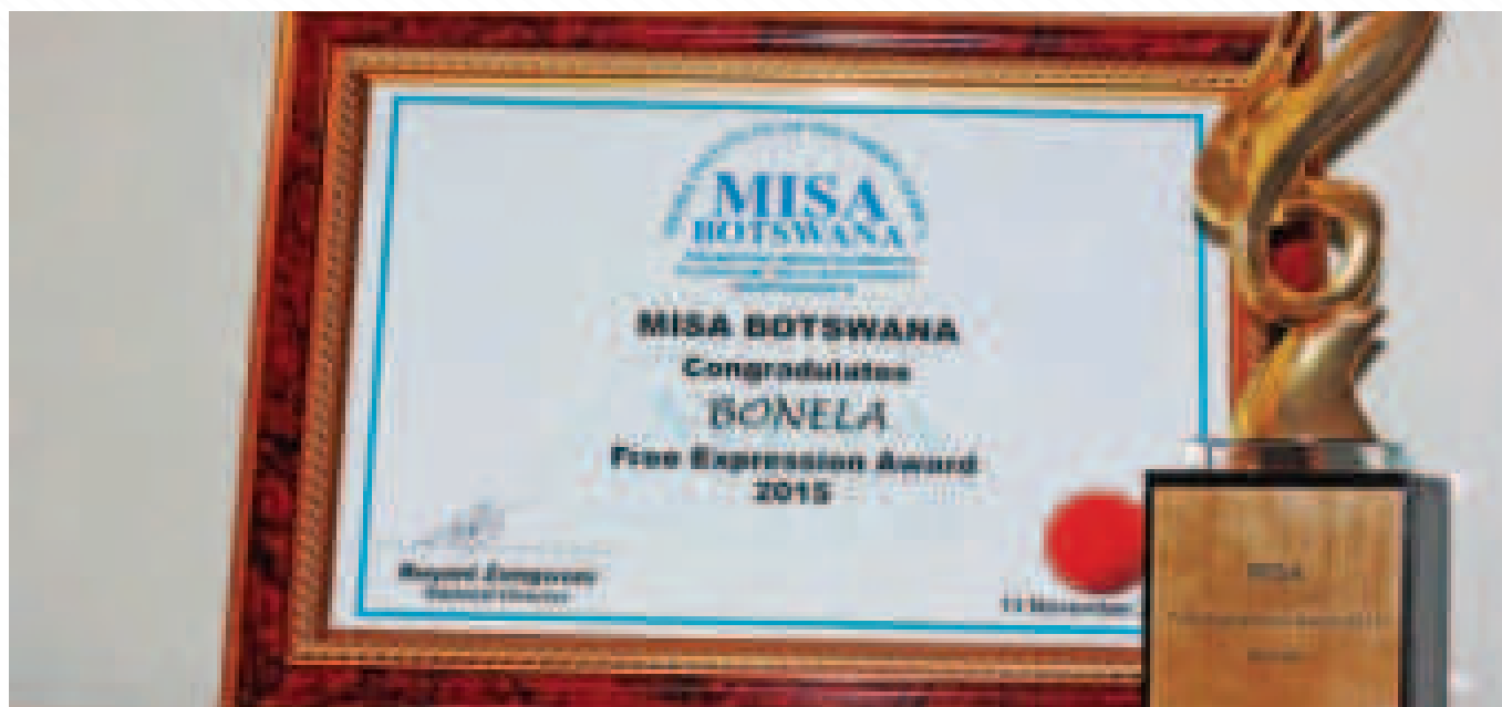
Figure 2: Free Expression Award by MISA