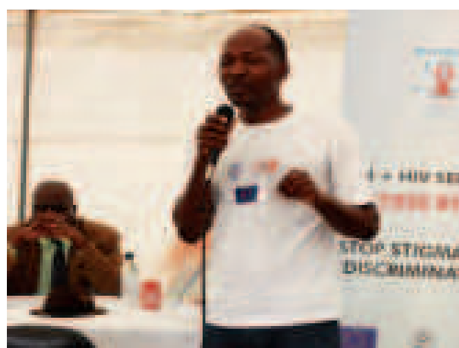
Vision Support Group