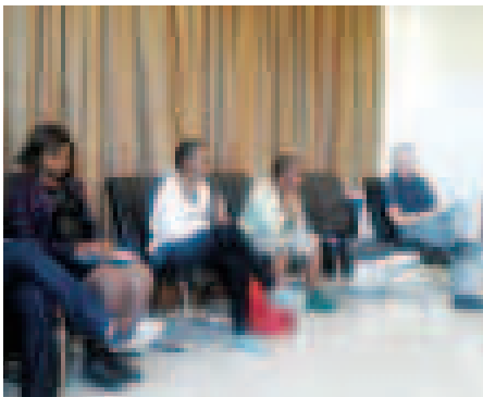
LILO training for BONELA team