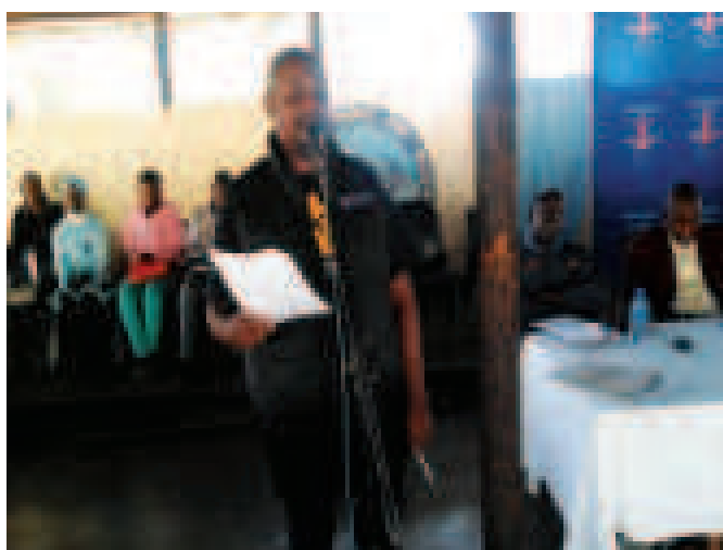
Men and Boys for Gender Equality

In order to promote access to justice, health and social services, 12 organisations facilitated for BONELA to reach the Lesbian, Gay, Bisexual, Trans-diverse and Intersex communities as well the general public through civic education on human rights, legal literacy as well as documentation of rights violations with support from the European Union (EU), United States Embassy and COC Netherlands. A total of 7547 people were reached through the network this year alone.