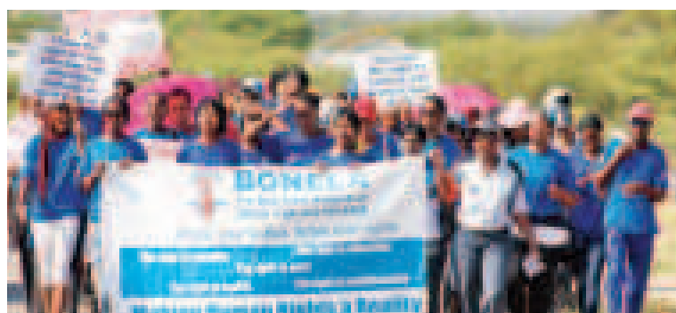
The International Families Day