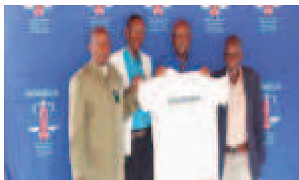
World AIDS Day in Tonota