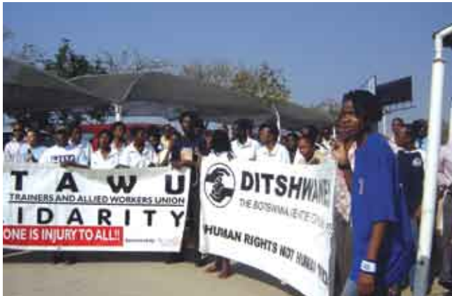
Civil society groups gaining momentum during the handing over of the HIV Employment Law Campaign petition.