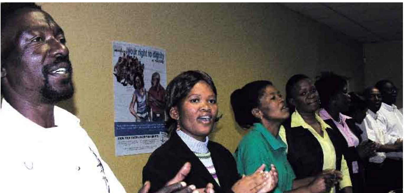
Representatives of civil society, trade unions and other organisations at a meeting to support passing a law protecting HIV-related rights in the workplace. The 6 September event kicked off the Campaign for an HIV Employment Law, which urged the public to sign a nation-wide petition and to participate in a march in Gaborone on 11 November 2006.