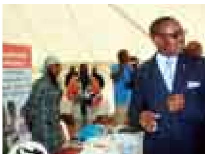
Vice-President of the Republic of Botswana Lt. General Mampoti Merafe at the BONELA stall at BOCONGO NGO week