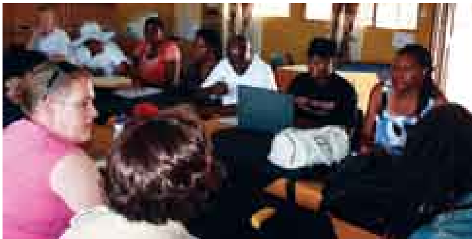
Refugee Support Group; BONELA; Botswana Red Cross and UNHCR gather at Dukwi Refugee Camp for a meeting at which it was announced that the Government of Botswana had bowed to local and international pressure to provide refugees.