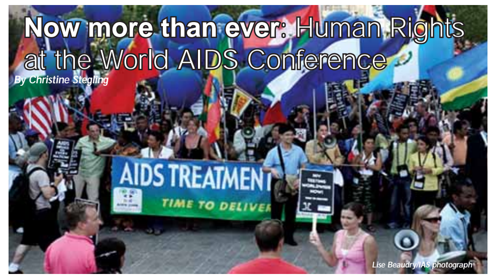
Hundreds march on the streets of Toronto on the first day of the conference in support of more accessible and affordable AIDS treatment.