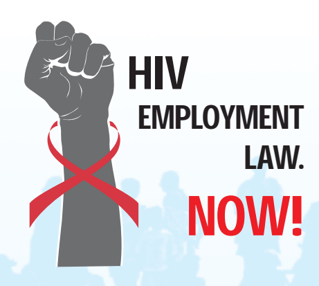
The HIV Employment Law Campaign hits Botswana (p and 8)