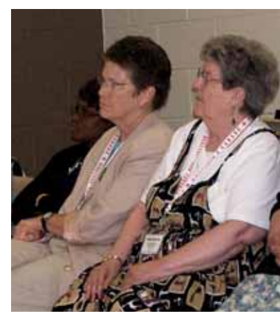
Canadian grandmothers participate in a Stephen aimed at building connections with their African co

According to a recent UNICEF report, Africa's Orphaned and Vulnerable Generations: Children Affected by AIDS 40 to 60 percent of orphans live in grandmother-headed