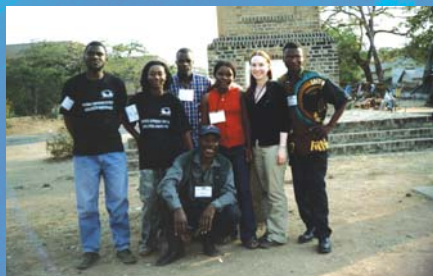
These are some of the participants of the Conference on Youth Children and HIV/AIDS