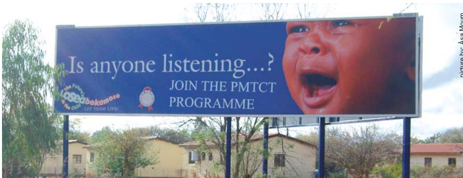
This billboard, presenting a baby in tears, advertises the PMTCT program.