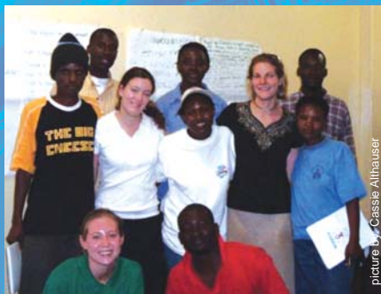
These are some of the participants of the Mahalapye AIDS fair workshop.

18th and facilitated a workshop on human rights at this event.