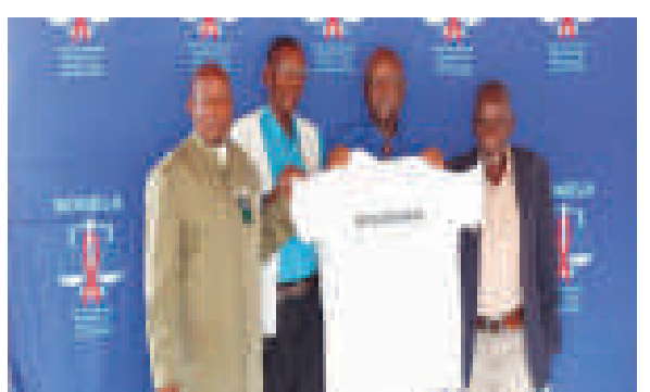
Figure 4: Campaigns through commemorations in pictures

Rights Barriers to Accessing Health and Social Care services in Botswana" which was delivered to the Permanent Secretary in the Ministry of Health to coincide with the 50th Anniversary of the International Covenant on Civil and Political Rights (ICCPR) and the International Covenant on Economic and Socio-Cultural Rights (ICESCR). The position paper calls on the Government of Botswana to expeditiously sign, ratify and domesticate the ICESCR which limits access to health as the right to health is not guaranteed by the Botswana constitution. These campaigns were followed by media appearances both in radio and newspapers, reaching many people.