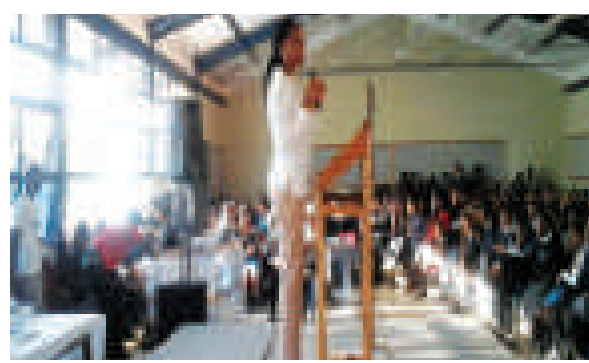
The International Families Day