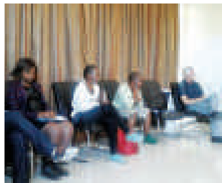
LILO training for BONELA team