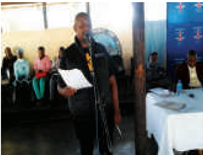
Men and Boys for Gender Equality

In order to promote access to justice, health and social services, 12 organisations facilitated for BONELA to reach the Lesbian, Gay, Bisexual, Trans-diverse and Intersex communities as well the general public through civic education on human rights, legal literacy as well as documentation of rights violations with support from the European Union (EU), United States Embassy and COC Netherlands. A total of 7547 people were reached through the network this year alone.