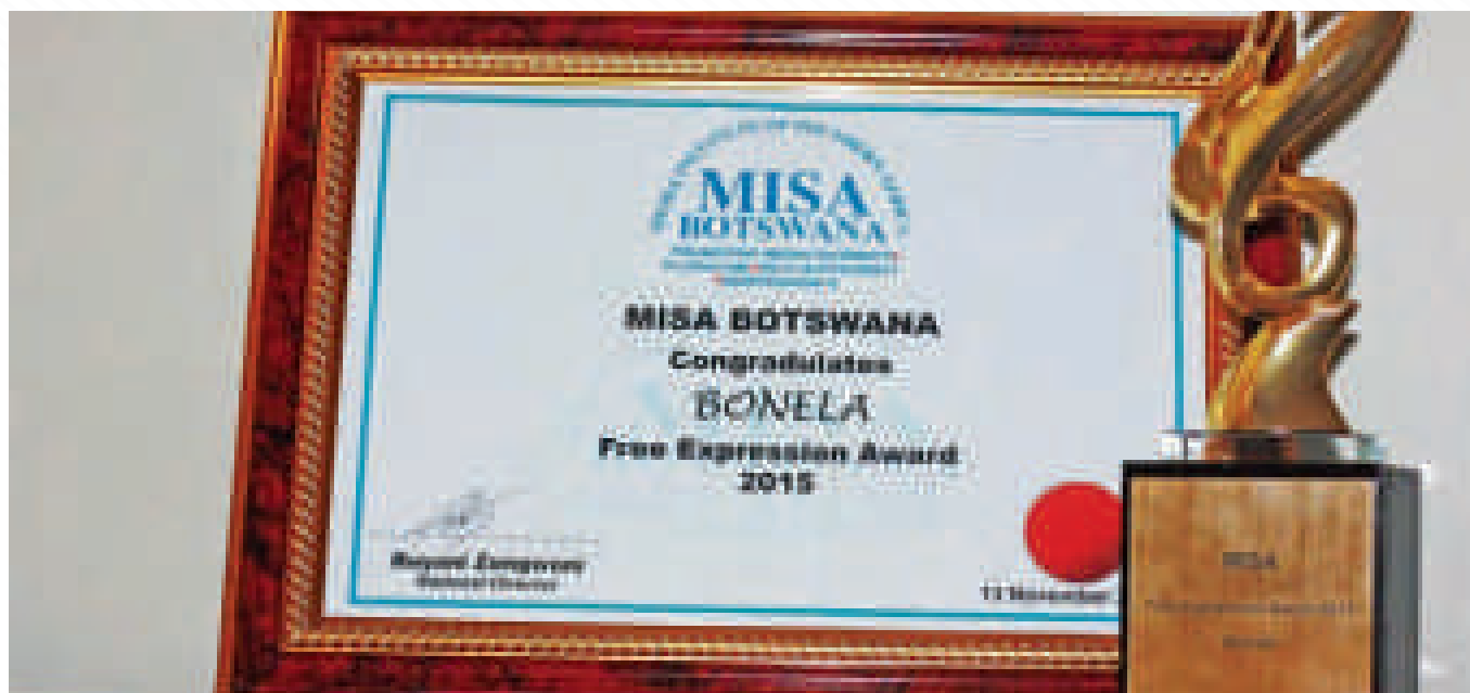
Figure 2: Free Expression Award by MISA