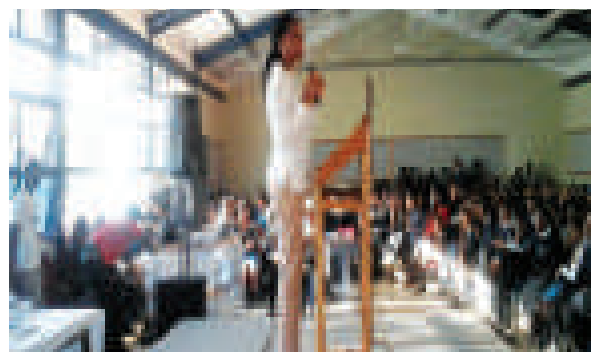
June 16 Commemoration