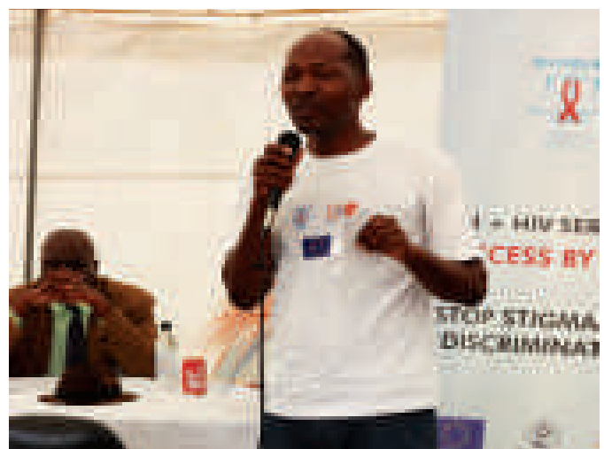
Vision Support Group