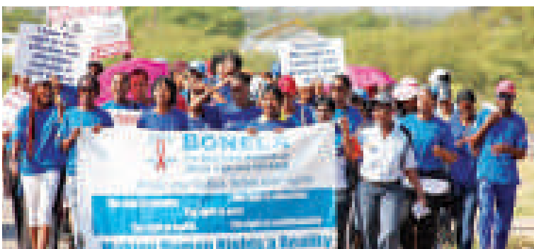
The International Families Day