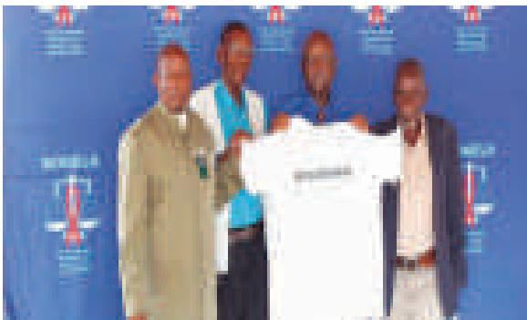
World AIDS Day in Tonota